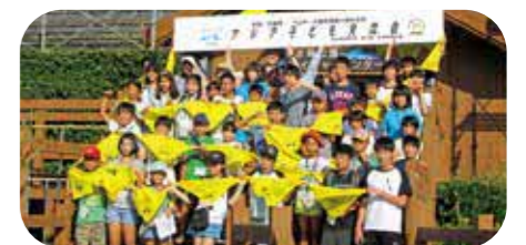
Asian Children's Exchange Program