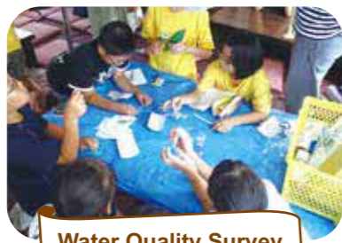
Water Quality Survey