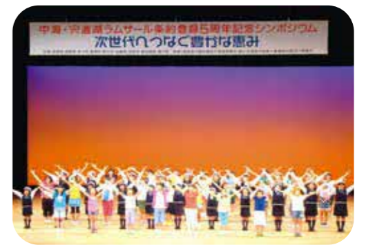
Environmental Education Musical: Ai-to-Chikyu-to-Kyobainin (Love, Earth and the Auctioneer)