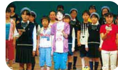
Special Message to the Lakes in the Future

Commemorative Symposium: Rich Blessings of Nature for the Next Generation