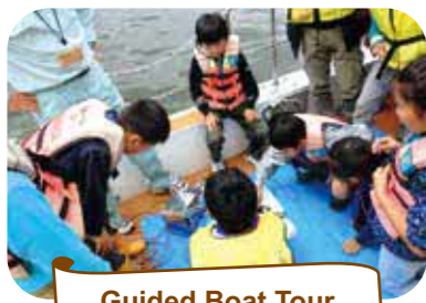
Guided Boat Tour

There are many ways we can learn about our wetlands – taking a guided boat tour on the lake, researching about the flora and fauna in the streams and rivers that feed the lakes, visiting nature museums to learn more about the birds and fish, listening to local elders tell stories and much more.