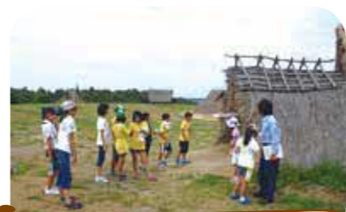
Lake History Study Trip