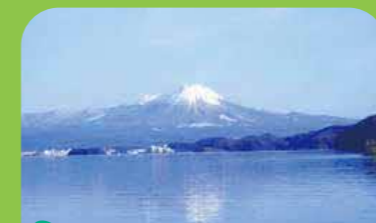
Mt. Daisen and Nakaumi