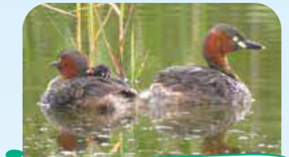
Kai-tsuburi (Little Grebe, Tachybaptus ruficollis )