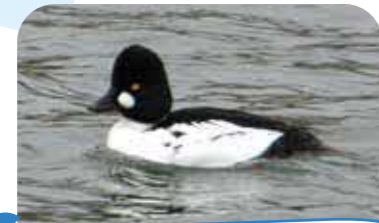
Hojiro-gamo (Common Goldeneye, Bucephala clangula )