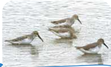
Hama-shigi (Dunlin, Calidris alpina )