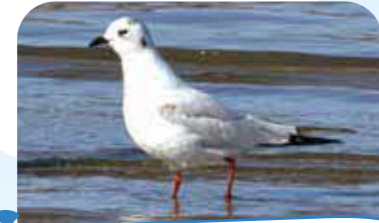
Zuguro-kamome (Saunders's Gull, Chroicocephalus saundersi )