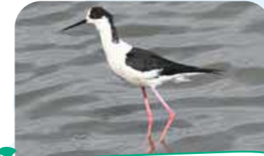
Seitaka-shigi (Black-winged Stilt, Himantopus himantopus )