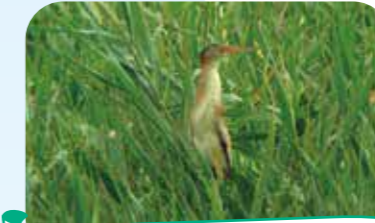
Yoshigo (Yellow Bittern, Ixobrychus sinensis )