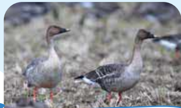
Hishikui (Bean Goose, Anser fabalis )