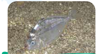
Hiiragi (Spotnape Ponyfish, Nucleola nuchalis )