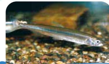
Wakasagi/Amasagi (Pond Smelt, Hypomesus nipponensis )