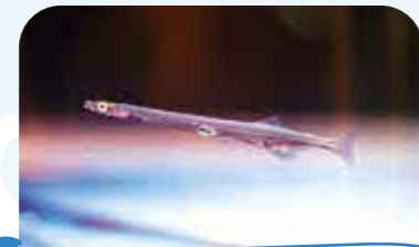
Shirauo (Icefish/Whitebait, Salangichthys microdon )