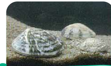
Asari (Clam, Ruditapes philippinarum )