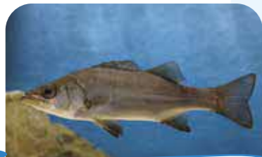
Suzuki (Sea Bass, Lateolabrax japonicus )