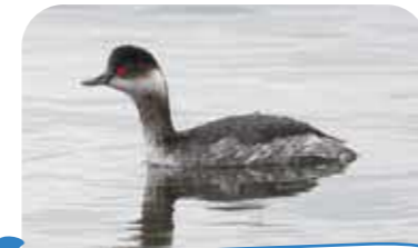
Hajiro-kaitsuburi (Black-necked Grebe, Podiceps nigricollis )