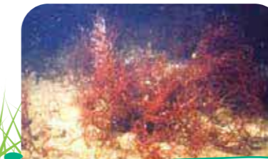
Ogonori (Sea Hair, Gracilaria verrucosa )