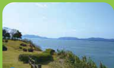
Shinji-ko Fureai Park

There are some spectacular scenic spots! You can go close to the shore too!