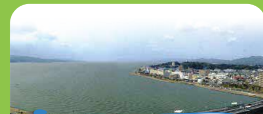
View from the lookout point across Shinji-ko