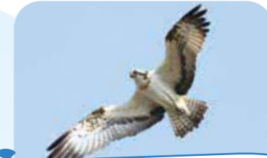
Misago (Osprey, Pandion haliaetus )