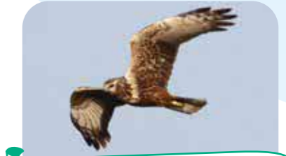
Chuhi (Eastern Marsh Harrier, Circus spilonotus )