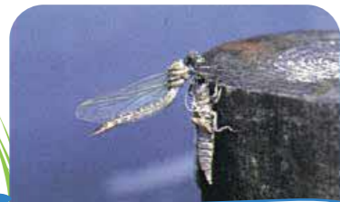
Nagoya-sanae (Dragonfly, Stylurus nagoyanus )