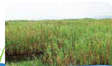
Reed Community (Yoshi, Phragmites )