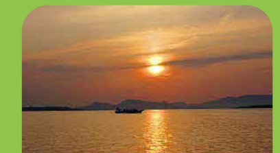
Sunset over Nakaumi