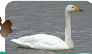
Ohakucho (Whooper Swan/Common Swan, Cygnus cygnus )