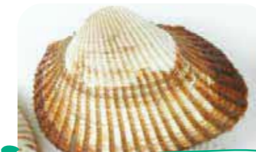
Sarubo-gai (Arc Clam, Scapharca kagoshimensis )