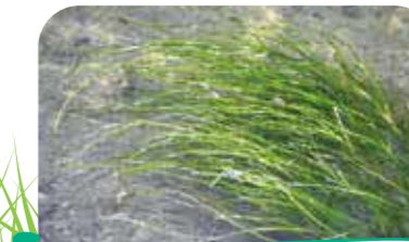
Koamamo (Japanese Eelgrass, Nanozostera japonica )

There are some spectacular scenic spots! You can go close to the shore too!