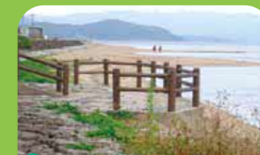
Hakucho-kaigan (White Swan Coast)