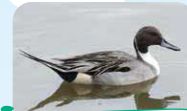
Onaga-gamo (Pintail/Northern Pintail, Anas acuta )