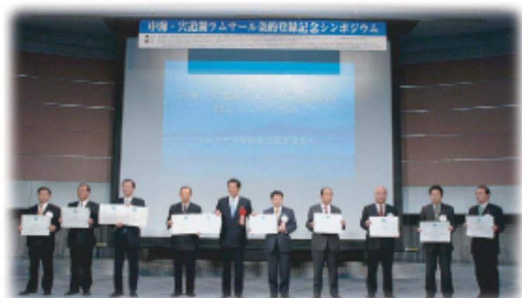
Certificate Presentation Ceremony at the Enlistment Commemoration Symposium

As we take pride in these two lakes, it is imperative that we (and future generations) conserve the natural resources of these sites.