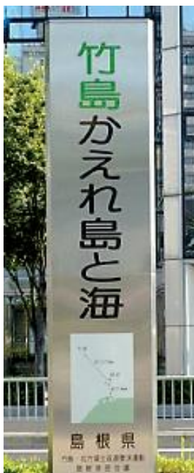
Advertisement Tower (in front of JR Matsue Station)