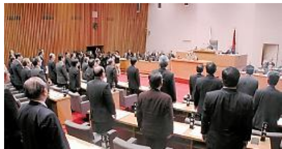
↑ Scene of the Shimane Prefectural Assembly adopting the ordinance.

In 2005, the centennial of the announcement by Shimane Prefecture, the Shimane Prefectural Assembly enacted an ordinance designating February 22 as “Takeshima Day.”