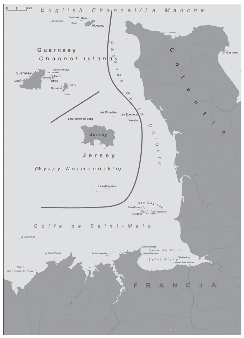
Chart: Locations of the Minquiers and Ecrehos (Broad Area) (Based on the website Wikipedia (https://ja.wikipedia.org/wiki/イギリスの王室属領#/media/ File:Wyspy_Normandzkie.png))