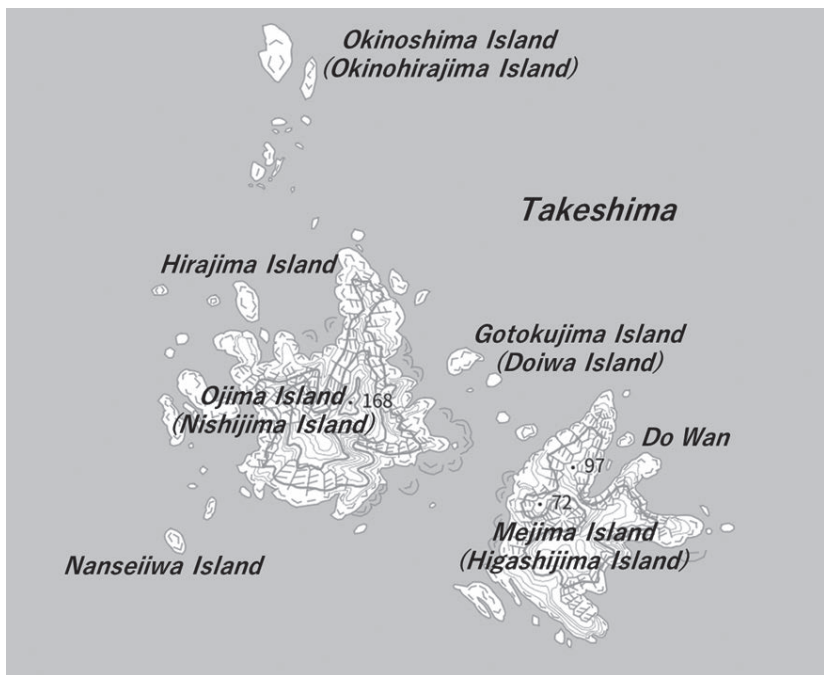
Detailed Map (All based on the website of the Ministry of Foreign Affairs of Japan (https://www.mofa.go.jp/region/asia-paci/takeshima/index.html))